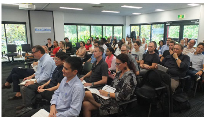
SeaCities Symposium, 2 March 2020, Griffith University

We believe the SeaCities initiative provides an excellent platform for urban experiments designed in response to the challenges associated with sea-level rise. As part of the Cities Research Institute, one of the largest groups of urban researchers in Australia, and in partnership with a network of researchers from around the world, including at Columbia and Delft University and with industry