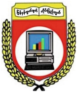
University of Computer Studies, Yangon, Myanmar