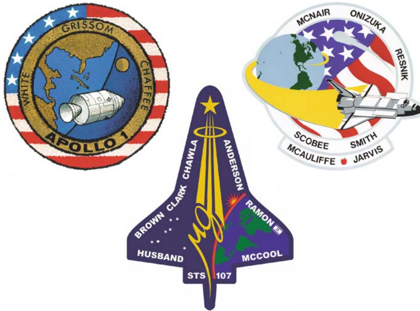
FIGURE 1 Lost mission patches.