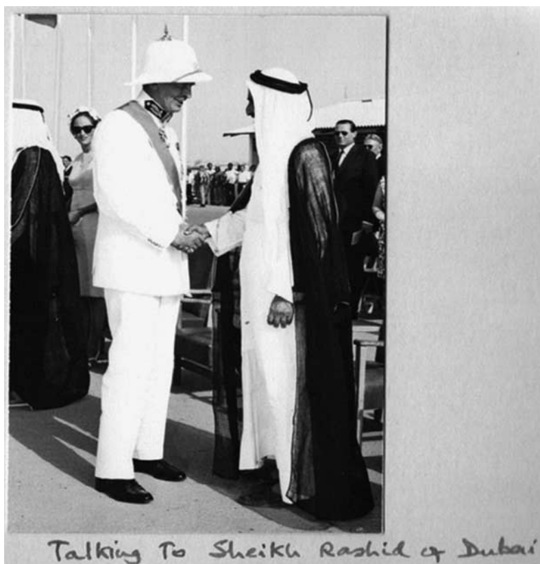
Sir William Luce talking to Shaikh Rashid bin Said Al-Maktoum of Dubai, c.1961–1966.