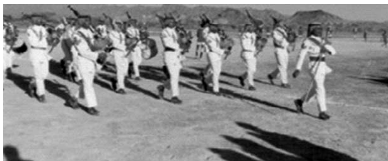
Bagpipers and drums in Manama, Bahrain, in 1966.