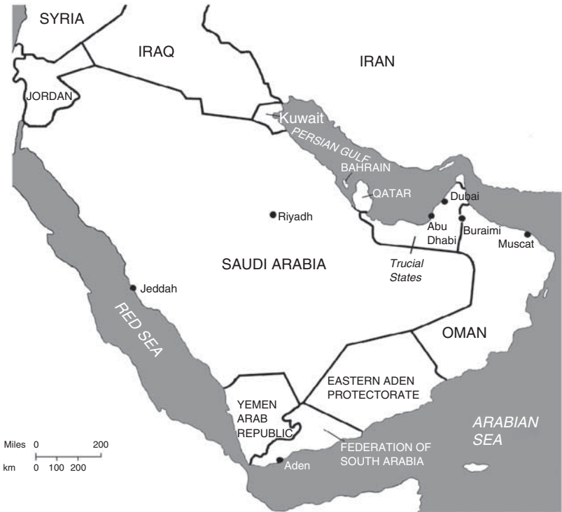
Map of the Arabian Peninsula, ca. 1963