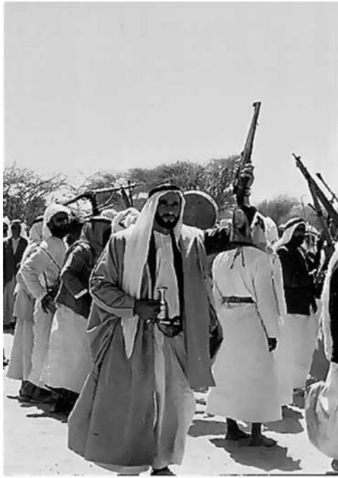
Shaikh Zayed bin Sultan Al-Nahyan on his wedding day in 1961.