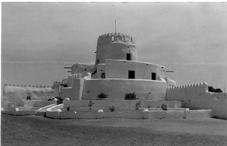
Jahili Fort in Al Ain, Abu Dhabi.