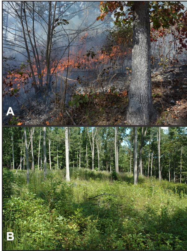
Figure 3. Silvicultural treatment, such as two-aged shelterwood in this mixed oak stand in the Ridge and Valley physiographic province of eastern Tennessee, USA, allows sunlight to enter the stand and stimulate groundcover response. Frequent, low-intensity prescribed fire (A, in October) is required to keep the understory from developing into a midstory and maintain the desired structure for various wildlife species (B, in September following fire).

tion), have softer interiors favored by cavity excavators and typically persist longer on the landscape (Hunter and Schmiegelow 2011). Following moderate-intensity fire, low-intensity fire can be used within a 6 yr to 7 yr fire-return interval to maintain a woodland structure that is necessary for several species of birds (e.g., great-crested flycatcher [ Myiarchus crinitus L.], summer tanager [ Piranga rubra L.], eastern wood-pewee [ Contopus virens L.], and red-headed woodpecker [ Melanerpes erythrocephalus L.]). Several bat species (e.g., the endangered Indiana bat, eastern red bat [ Lasiurus borealis Müller], and evening bat [ Nycticus humeralis Rafinesque]) also benefit from canopy gaps and decreased structural clutter, which allows for greater foraging efficiency (Ford et al. 2006, Dickinson et al. 2009, Greenberg et al. 2013, Amelon et al. 2014, Starbuck et al. 2015).