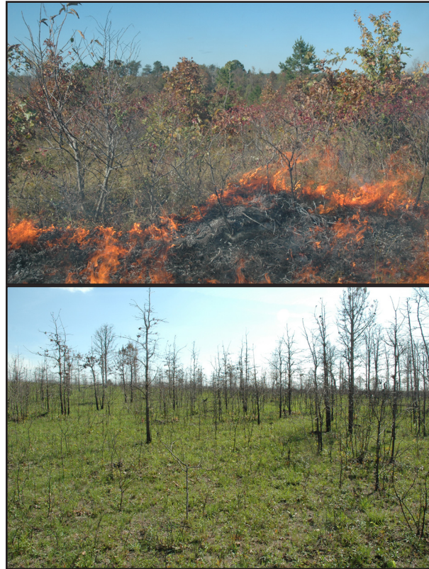
Figure 2. The biggest effects of fire on wildlife are indirect. Fire influences the structure and composition of vegetation, which changes availability of cover and food for wildlife. Indirect effects can influence presence, density, reproduction, survival, movements, and home range of wildlife in a particular area.

Some discussion of fire and silviculture in hardwoods systems is warranted before de-