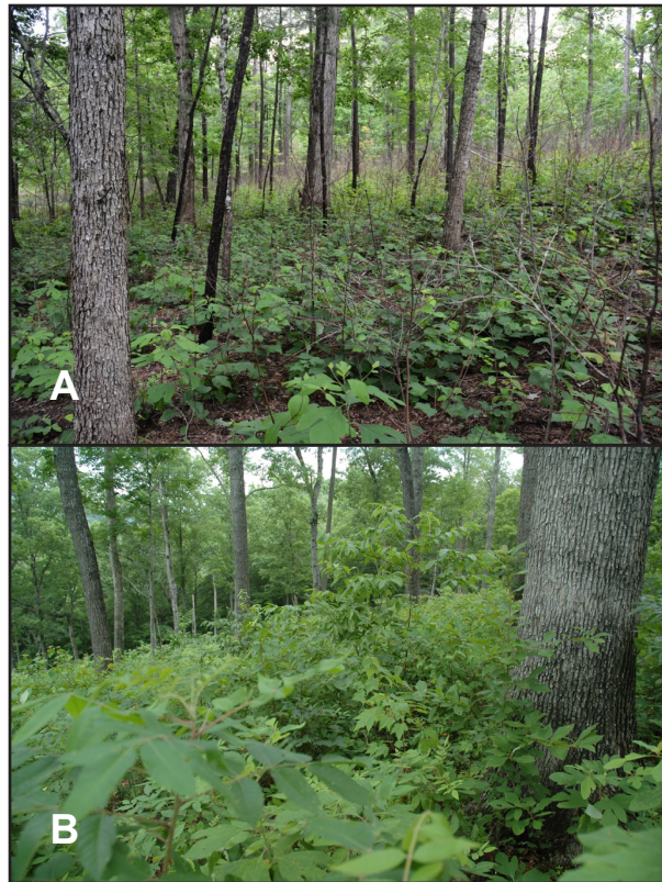
Figure 4. Early growing-season fire in mixed oak stands with a broken canopy will top-kill small woody stems, but the stems sprout back quickly, resulting in little compositional change in the understory (A; the growing season following second fire). However, for forest songbirds that nest and forage in a well-developed understory, as well as wild turkey and white-tailed deer, this type of structure provides good cover (B; second growing season following fourth fire).

Limited data suggest that burning later in the growing season may reduce woody stem density more completely than burning during the dormant or early growing season. Lewis et al. (1964) reported that March burning in the Ozark Mountains increased hardwood sprouts, whereas burning in April, June, and August decreased hardwood sprouts, with slightly bet-