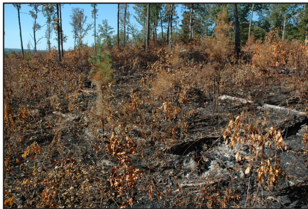
Figure 5. Fire intensity does not have to be great to top-kill small trees. These small trees were top-killed by a low-intensity prescribed fire in early October on the Cumberland Plateau in Tennessee in an effort to encourage more herbaceous groundcover in a developing oak savanna.

Dendrochronological evidence indicates that dormant-season fire was much more frequent than growing-season fire historically in the Central Hardwoods and Appalachians, suggesting that native Americans were equally as responsible as lightning for spread of fire in this region, if not more so (Shumway et al. 2001, Flatley et al. 2013). The majority of lightning-caused fires in the region occurred from April through August (Ruffner and Abrams 1998, Cohen et al. 2007), but fires later in the growing season (August to October) may lead to increased fire spread because of drier conditions (Peterson and Drewa 2006). Fire prescriptions in hardwood systems of the Central Hardwoods and Appalachians largely have involved dormant-season fire (Van Lear