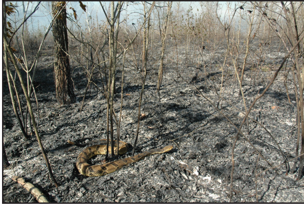
Figure 8. If hibernacula occur on the site, burning during the early growing season is more likely to have a direct effect on several snake species than burning during the dormant season before they emerge. However, burning during the early growing season does not necessarily mean snakes are going to die. This timber rattlesnake was observed immediately post burning in early April.

sites where they occur most readily (Moorman et al. 2011).