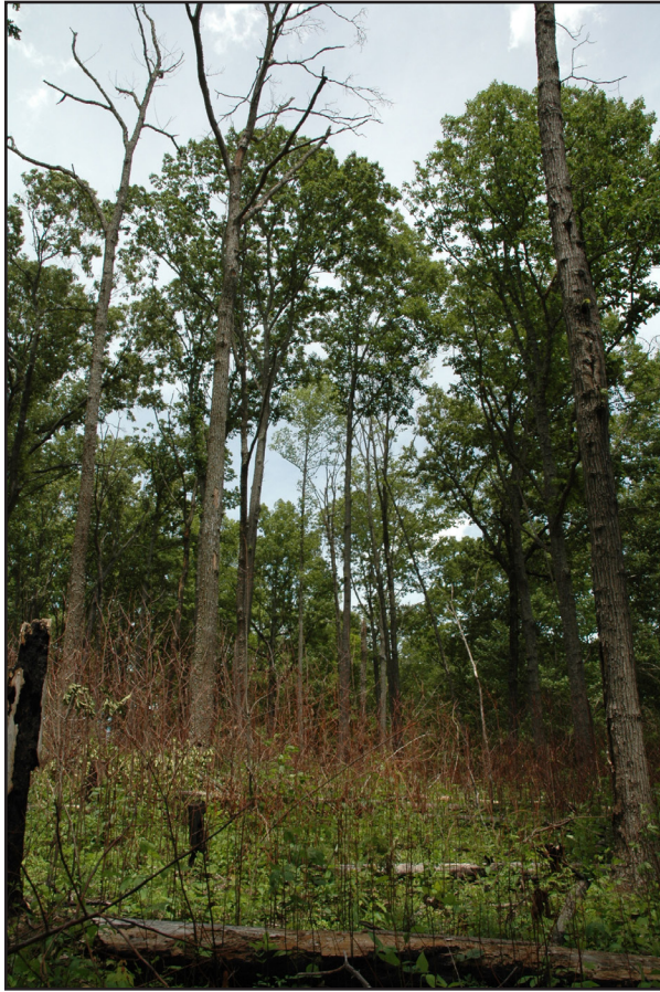
Figure 7. Prescribed fire can increase habitat suitability for several species of bats by creating snags and reducing clutter in the midstory.

species will benefit more than others, and some may be harmed more than others, which makes stating explicit objectives for the burn so important. Until research is completed on population response of various wildlife species to season of burning in the Central Hardwoods and Appalachians, recommendations for season of burning must be based on habitat conditions, fire effects on vegetation (for wildlife and ecosystem restoration), and the biology of focal species. Dormant-season fire has been used most commonly in the Central Hardwoods and Appalachians. However, growing-season fire (especially late in the growing season) must be used in many situations in order to accomplish management goals. Of course, other factors such as fire frequency and