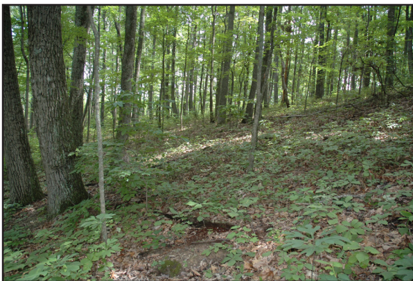
Figure 6. Burning hardwood stands in the Central Hardwoods and Appalachians from May to August is usually difficult because of shade effect and moisture retained in the leaf litter.

and Waldrop 1989, Wade et al. 2000, Brose et al. 2001). Burning during the growing season is much more difficult in hardwood systems than in pine systems because of the shade effect and increased litter moisture in hardwoods, and the abundance and flammability of hardwood leaf litter is less than pine leaf litter (Varner et al. 2015). Often, burning May through mid-August is not possible in hardwood stands with considerable canopy coverage (Figure 6) except during exceptionally dry summers and, during those periods, it is common for state forestry agencies to implement burn bans. For much of the region, burning during the late growing season (August through October) historically occurred during extended dry periods when lower precipitation and less humidity resulted in drier fuels (Knapp et al. 2009). Following canopy-reduction treatment that allows additional sunlight into the stand, drying is expedited, better facilitating burning during these months. In open areas (e.g., old fields, forest openings, and savannas), conditions may allow burning during any month of the summer. Increased moisture and decreased flammability of fuels in hardwood systems during the growing season leads to relatively less-intensive fires than during the dormant season, which differs from pine systems in which increased fine fuels and sunlight