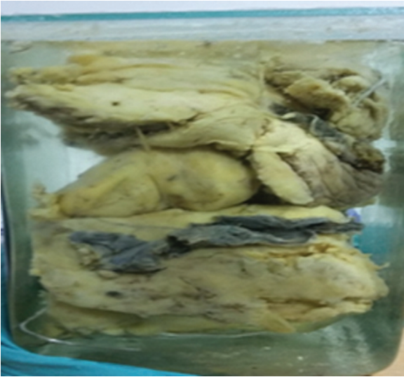
Jar of excised mass.