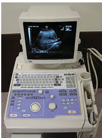
Aloka ultrasound machine.