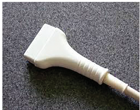
High-resolution ultrasound probe.