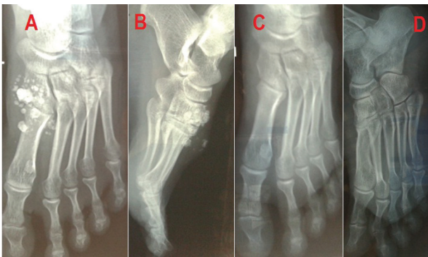
(a, b) Preoperative radiograph (anteroposterior and lateral) showing multiple radio-opaque loose bodies scattered around the first tarso-metatarsal joint, mainly on the dorsomedial aspect, and (c, d) post-operative radiographs showing removal of all loose bodies.