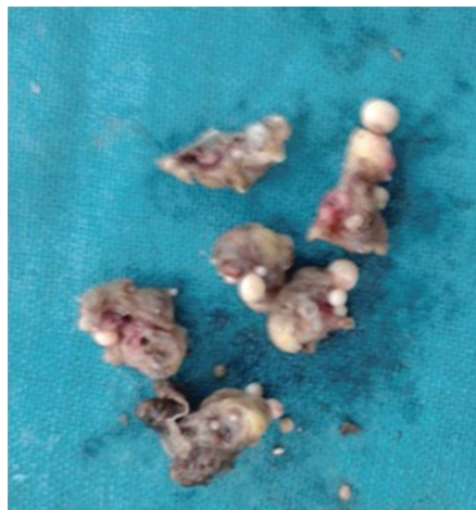
Excised multiple loose bodies.

but without calcifications. In phase II, nodular synovitis and cartilaginous loose bodies are usually present. In phase III, united and calcified loose bodies with resolved synovitis are present [6]. Malignant transformation into chondrosarcoma has been reported in 5% of cases. Synovial chondromatosis must be differentiated from other conditions such as pigmented villonodular synovitis, osteochondritis dissecans, rheumatoid arthritis, soft-tissue calcification, chondrosarcoma, and lipoma arborescence with osseous metaplasia [1,6]. Treatment in symptomatic patients must be surgical and it depends upon the severity of symptoms and functional demand of the patient. In younger patients, arthroscopic surgery should be preferred for better rehabilitation and early return to work. If arthroscopic facility is not available, open surgical excision of loose bodies with or without synovectomy is the only option as in present case. In phase III, only loose body excision is adequate treatment. In the presence of synovitis, chances of recurrence are usually high. Recurrence rate after surgical procedure ranging from 7 to 23% has been mentioned in the literature [7].