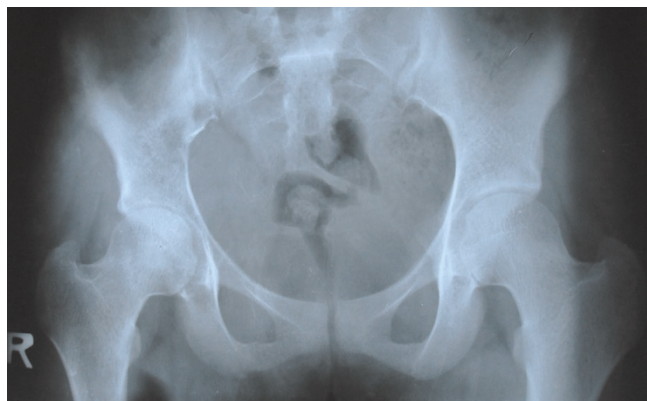
Figure 1. Plain X-ray pelvis AP view showing reduced right hip joint space with hard to pick changes in the iliac bone.

We report a case of 18-year-old female patient, Asian Indian in origin presenting with one-month history of pain right hip, limp and fever off and on. On examination patient was febrile, there was localized tenderness over ilium, no swelling, had restricted internal and external rotation of right hip and an apparent lengthening of 1.5 cm. Patient had no rectal or urinary complaints. Investigations revealed a sedimentation rate of 45 mm, hemoglobin 10.6 gm%, TLC of 12500, PCR for tuberculosis was negative. Plain radiograph pelvis in AP view showed reduced right hip joint space with subtle, hard to pick changes in the right ilium (Figure 1). Digital radiograph pelvis in same view showed reduced right hip joint space with displaced fat planes suggestive of possible effusion. Left hip was normal (Figure 2). Patient was treated with conventional non steroidal anti-inflammatory drugs, intravenous antibiotics and a below knee skin traction with little benefit to her. MRI pelvis was done which revealed an altered marrow signal of right acetabulum and iliac bone (hypointense on T1W and hyperintense on T2W/STIR images) with a large soft tissue component