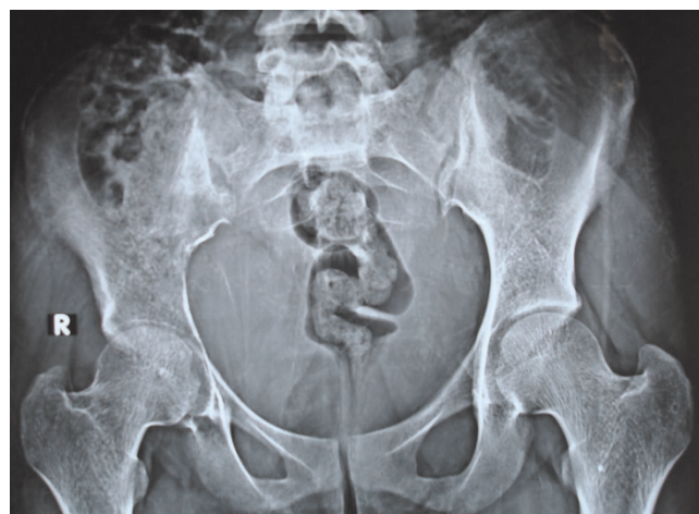
Figure 2. Digital X-ray pelvis AP view showing reduced right hip joint space with displaced fat planes suggestive of effusion.

on its posterior-medial aspect indenting the urinary bladder. The adjacent muscles and intramuscular planes were normal. Both SI joints were normal. The left hip joint was normal. There was no pelvic lymphadenopathy or free fluid (Figure 3). Keeping in view the MRI findings, biopsy was sought. The incision was given over the suspected area and tumor tissue was identified. This tissue was preserved for histopathological examination and sent to the pathologist. The pathologist reported it as densely packed, small, round cells arranged into sheets or lobules separated by fibrovascular connective tissue septa consistent with ES (Figure 4). Immunohistochemistry for CD99 marker was positive. The patient is being treated currently with multidrug chemotherapy using drugs, which include vincristine, doxorubicin, ifosfamide and etoposide. Patient has now been on primary chemotherapy for 5 months and it will be continued for a month more.