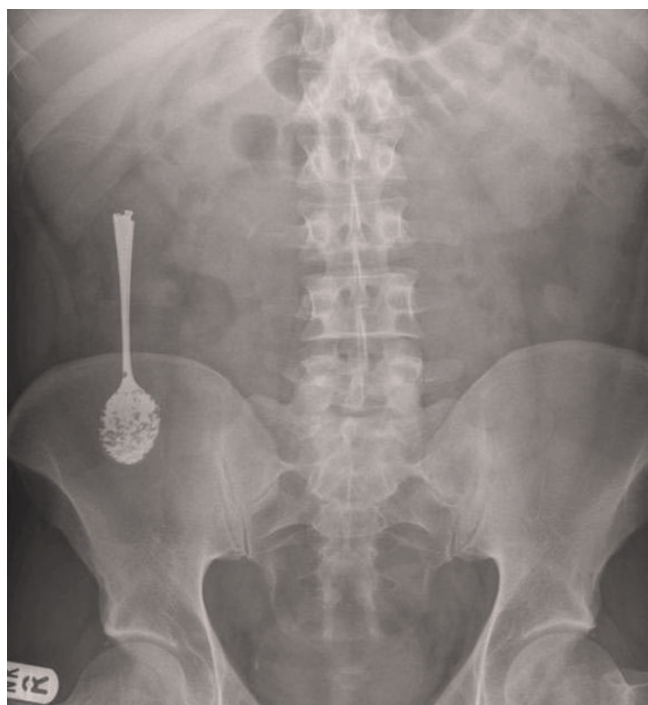
Figure 1. Plain abdominal X-ray.

evaluation and attempt at retrieval. The procedure was not successful at removing the spoon, due to the adherence of the spoon to the colon wall, but confirmed its position in the ascending colon. Some minor inflammatory tissue and ulceration was seen in the colon wall at the two ends of the spoon hence hindering adequate snaring and retrieval also (Figure 2). The patient was subsequently seen in clinic and as he felt so symptomatic, where the pain has been increasing over the last few months prior to presentation and became refractory to over the shelf analgesia, was scheduled for a laparoscopic limited right hemicolectomy.