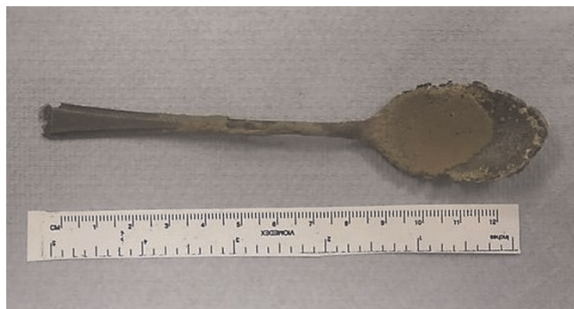
Figure 3. The spoon after retrieval.

Foreign body (FB) ingestion is a common presentation to the surgical team, usually as children accounting for about 80%; the remainder usually including prisoners, psychiatric patients, alcoholics, and senile patients [1,2]. Most ingested FBs pass through the GI tract without clinical