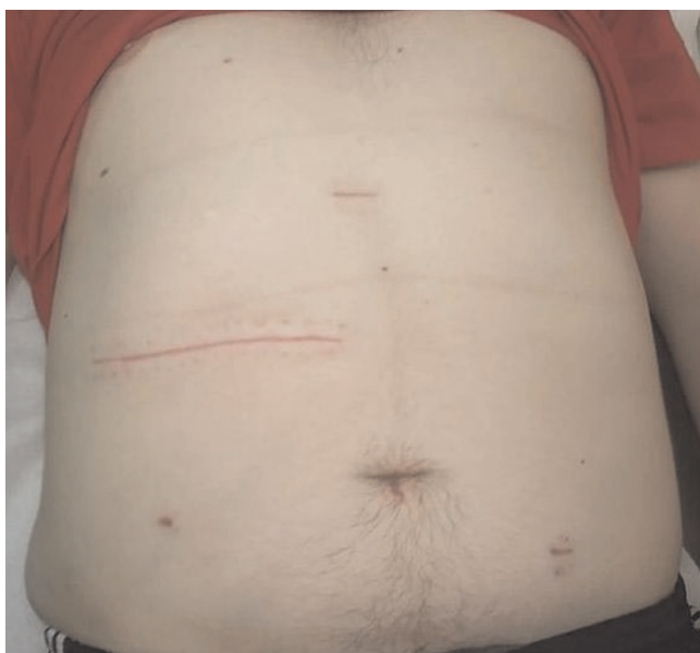
Figure 4. Follow up in 2 months.

consequences; however in about 10-20% endoscopic removal is warranted and 1% require surgical intervention [3]. In the oesophagus there are three anatomical narrowing where FBs may become lodged: the upper and lower oesophageal sphincters and where the aortic arch crosses over. There is a more than 90% chance that a FB is passed spontaneously once it reaches the stomach. However, objects larger than two centimeters in diameter also may lodge at the pylorus; whereas objects longer than six centimeters may become entrapped at the pylorus or at the C-curve of the duodenum between the first, second and third parts of the duodenum and rarely pass beyond that [4,5]. Other than this, the only remaining obstacle against the passage of the FB is the ileocecal valve. Rarely, a foreign body becomes entrapped in a Meckel's diverticulum or at the sigmoid S-curve which is more flexible than the duodenal C-curve since it is not fixed in the retroperitoneum and hence can give way to the passage of the FB [6]. In the case presented above there is a rare presentation where a spoon longer than 6 centimeters and wider than 2 centimeters has passed all the way down and lodged the ascending colon due to erosion and adhesion into the colon wall (or probably could not negotiate its way through the valve of Gerlach (ileocecal valve)).