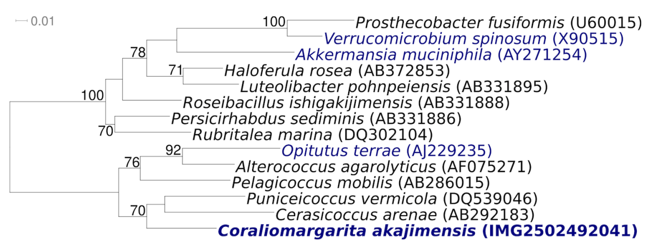
Figure 1 shows the phylogenetic neighborhood of C. akajimensis 040KA010- 24^{T} in a 16S rRNA based tree. The two copies of the 16S rRNA gene in the genome are identical with the previously published sequence generated from DSM 45221 (AB266750).

Figure 1. Phylogenetic tree highlighting the position of C. akajimensis 04OKA010-24<sup>T</sup> relative to the other type strains within the phylum Verrucomicrobia . The tree was inferred from 1,373 aligned characters [15,16] of the 16S rRNA gene sequence under the maximum likelihood criterion [17] and rooted in accordance with the current taxonomy [18]. The branches are scaled in terms of the expected number of substitutions per site. Numbers above branches are support values from 300 bootstrap replicates [19] if larger than 60%. Lineages with type strain genome sequencing projects registered in GOLD [20] are shown in blue ( Akkermansia muci-niphila CP001071, Opitutus terrae CP001032), published genomes in bold.