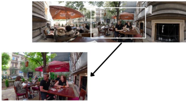
Fig. 1 Comparison of perceptual fields accessible to subjects under two conditions. At the top is a 360-degree view as seen in HMD; the bottom screen shows the scene on a 2D screen.

goggles (head-mounted device). We used the HMD in the experimental conditions, and a computer screen in the control group. In the experimental condition, subjects were able to view the full perceptual field, covering 360 degrees, while the subjects watching the movie on the screen viewed a slice of that scene, covering the central visual field, which was adapted to the flat screen. A comparison of the image observed by subjects in both groups is presented in Fig. 1.