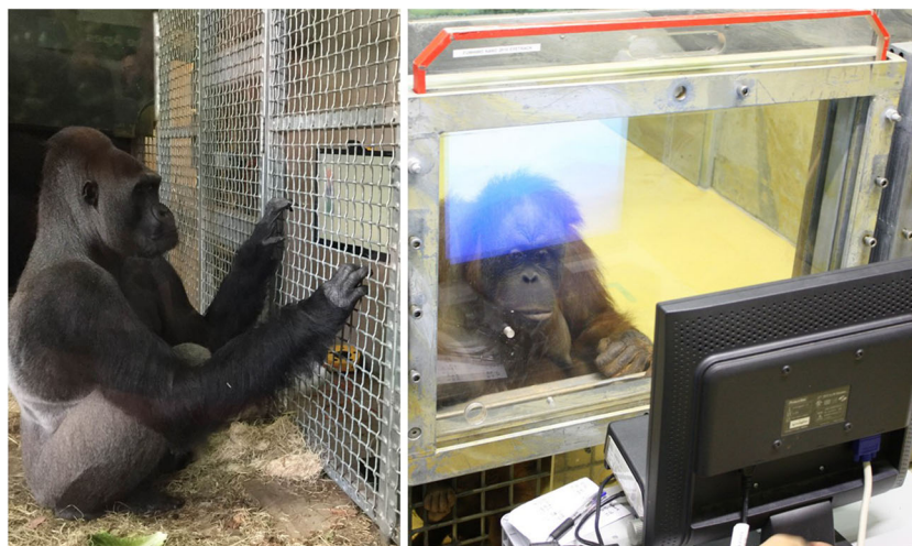
Fig. 2 Examples of noninvasive restraint-free eye-tracking methods in which subjects look through mesh (left, Lincoln Park Zoo, USA) or a transparent viewing panel (right, Wolfgang Köhler Primate Research Center, Germany).