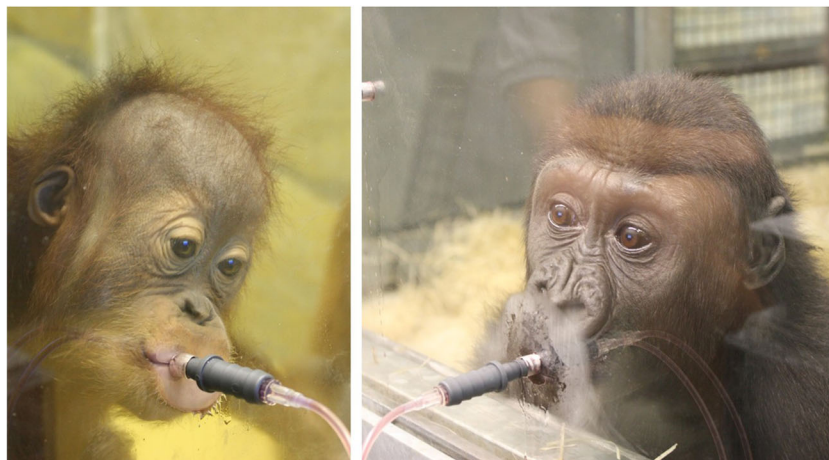
Fig. 3 A noninvasive, restraint-free eye-tracking setup in which subjects drink juice throughout testing from a fixed point that orients their face toward the eye tracker and keeps their head in a steady position. Shown

here, an orangutan (left) and a gorilla (right), both at the Wolfgang Köhler Primate Research Center, Germany.