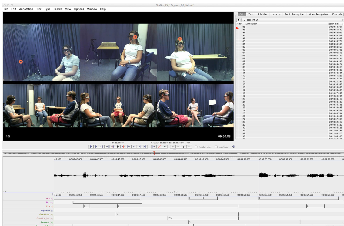
Fig. 1 Still image showing an extract from the multisource synchronised audio-video recordings (and annotation software ELAN) serving as the basis for the present analyses.

Gestures For each question, the occurrence of gestures was annotated (using the software ELAN 4.61; Wittenburg, Brugman, Russel, Klassmann, & Sloetjes, 2006). Gestures were defined as communicative movements of head or hand (and torso) that speakers produced as part of conveying the question (or the response); this included (a) iconic and metaphoric gestures (McNeill, 1992); (b) deictic gestures