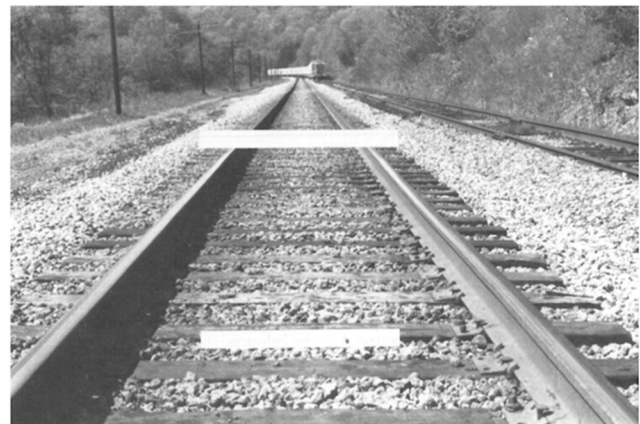
Fig. 1 Ponzo illusion (from Gregory, 2005: 1243)

In one illustration, Kahneman (2003a: 1460) highlights the problem of accurately judging or comparing the size of objects by using a two-dimensional picture that seeks to represent a three-dimensional environment. Similar to the classic Ponzo illusion (see Fig. 1, copied from Gregory, 2005: 1243; cf. Ponzo, 1912), in the picture the focal objects (in the above case, the white lines) that are farther away (or higher, in the two-dimensional image) are seen as larger by human subjects, even though the objects are the same size on the two dimensional surface. Kahneman calls this “attribute substitution” and argues that the “illusion is caused by the differential accessibility of competing interpretations of the image” – and further that the “impression of three-dimensional size is the only impression of size that comes to mind for naïve observers—painters and experienced photographers are able to do better” (Kahneman, 2003a: 1461–1462). The perceptual