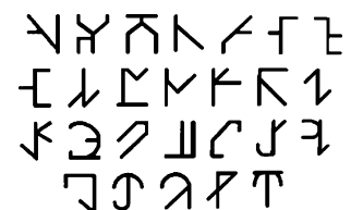
Fig. 1 Pseudoletters used in experiments 1 and 2

T2 was presented at one of three lags after T1: 100, 300, or 900 ms, i.e., lags 1, 3, and 9, respectively. The lag was selected randomly on each trial, with the constraint that there was an equal number of trials per lag. Pseudoletter distractors continued to be presented during the inter-target lag. The RSVP stream ended with a 7-ms presentation of T2. The sequence of events on any given trial is illustrated in the left-hand panel of Fig. 2 . In the present context, the