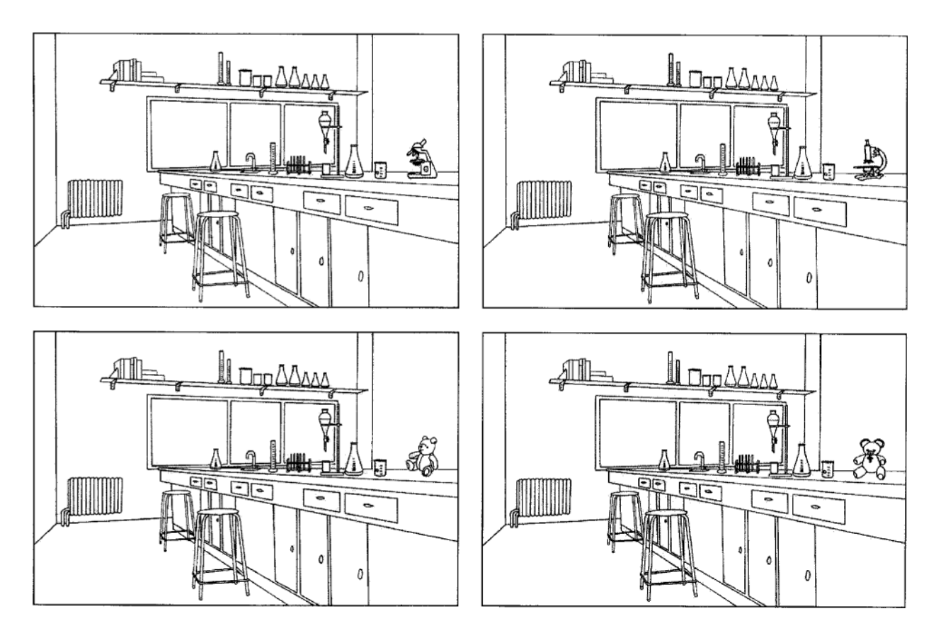
Figure 1. An example of a stimulus scene. The top panels illustrate a token change for a semantically consistent target object (microscope), and the bottom panels illustrate a token change for a semantically inconsistent object (teddy bear). The laboratory scene was paired with a bedroom scene in which the teddy bears were consistent and the microscopes inconsistent.

microscope in a laboratory) or semantically inconsistent (e.g., a teddy bear in a laboratory), as illustrated in Figure 1. Prior research has demonstrated that semantically inconsistent objects are retained more accurately in long-term memory than are semantically consistent objects (Friedman, 1979; Pedzek, Whetstone, Reynolds, Askari, & Dougherty, 1989). If the scene representation constructed during extended viewing retains detailed visual information in memory from previously attended objects, then performance in this experiment would be expected to reflect the established characteristics of scene memory. Thus, we expected to find a change detection advantage for semantically inconsistent objects. In addition, such an effect would replicate the finding that changes to semantically inconsistent objects are detected sooner and more accurately than are changes to consistent objects (Hollingworth & Henderson, 2000).