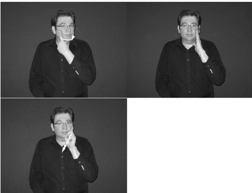
Figure 4. The nonsense sign in the two upper panels consists of two unmarked handshapes and two locations (on both sides of the face). This sign was reproduced, as shown in the lower panel, as the BSL sign for GIRL, with only one handshape (first handshape deleted) and only one location (first location deleted), and with substitution of a more marked movement (arc) with an unmarked (straight) movement, which is repeated (internal movement added). These are reproductions, by the same signer, of an actual stimulus and an actual response.

Substitutions and omissions of the arc or circle path in the nonsense sign can be considered simplifications of the nonsense signs with permissible combinations of movement (e.g., circle and straight movement; the more marked arc and circle movement being replaced by the unmarked straight movement) and also could be due to the pressure to make monosyllabic forms because the majority of BSL signs are monosyllabic. However, in