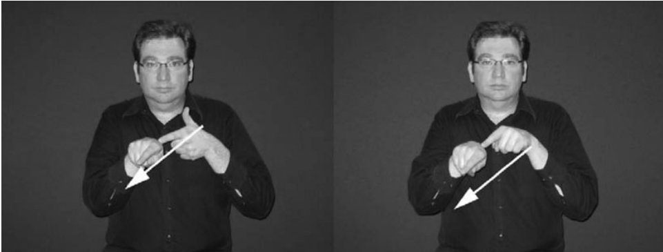
Figure 3. The nonsense sign on the left (with a more marked handshape) was reproduced, as shown on the right, as the BSL sign for FOLLOW (with a less marked handshape). Note that these are reproductions, by the same signer, of a stimulus and a response in the experiment.

movement omissions involved the deletion of a second path in the sign, especially if it was an arc or circle (15 of the 128 nonsense signs had two path movements; out of the 131 path movement omissions, 80 were instances of arc and circle omissions). Path substitutions (in response to the 45 nonsense signs with an arc/circle path) almost entirely involved the substitution of an arc movement with a straight movement (see Figure 4).