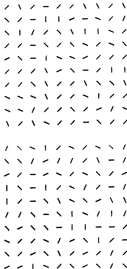
Fig. 1. Examples of patterns: (1) 45 deg random compared to (2) Pattern 5.

Ss were shown samples of the patterns and told how the "structured" and "random" patterns were constructed. Ss were then shown pairs of patterns consisting of the most structured or most random as a standard paired with each of the other seven patterns in a series for each of the four dominant angles. Fifteen Ss