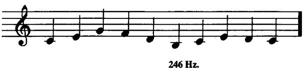
Figure 1. The standard melody and change in the sixth note for each condition.