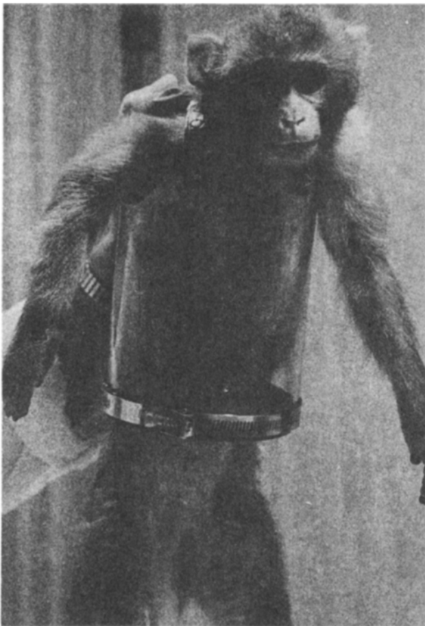
Fig. 1. Rhesus monkey in restrainer.