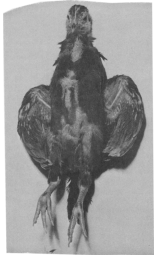
Fig. 1. An immobilized 3-week-old Production Red chicken.

The original Ss consisted of 80 straight-run Production Red chickens ( Gallus gallus ) obtained from a local hatchery at 1 day of age. The birds were housed in commercial brooders and