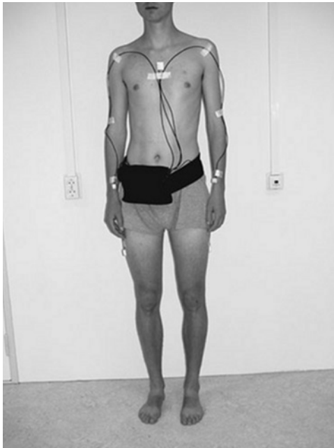
Figure 1. A subject wearing the Upper Limb Activity Monitor, with accelerometers on the forearms, trunk, and thigh(s) and the data recorder in a waist-worn machine-washable bag.

The basic ULAM configuration consists of five body-mounted uni- and biaxial piezoresistive acceleration sensors (ADXL202, 1.5 \times 1.5 \times 1.0 cm; Analog Devices, Breda, the Netherlands; adapted by TEMEC Instruments, Kerkrade, the Netherlands) that are connected to a portable data recorder (see Figure 1). The raw acceleration signals yielded by the piezoresistive accelerometers are a combination of a component of the gravitational acceleration ( 9.81 \text{ msec}^{-2} ) and a component of the inertial acceleration (Bussmann et al., 2001). The sensors are fixed on Rolian Kushionflex (Smith & Nephew, Hoofddorp, the Netherlands) or silicone-based stickers (Schwa-Medico, Ehringshausen, Germany) by double-sided tape; both ma-