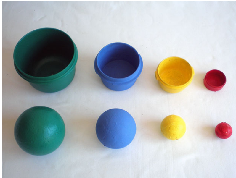
Figure 1. Facilitating task: Stimulus material.

The validity of the observation instrument was calculated using the GT software (Ysewijn, 1996), although it was first necessary to use the SAS 9.1.3 package Procedure VARCOMP (Schlotzhauer & Littell, 1997).