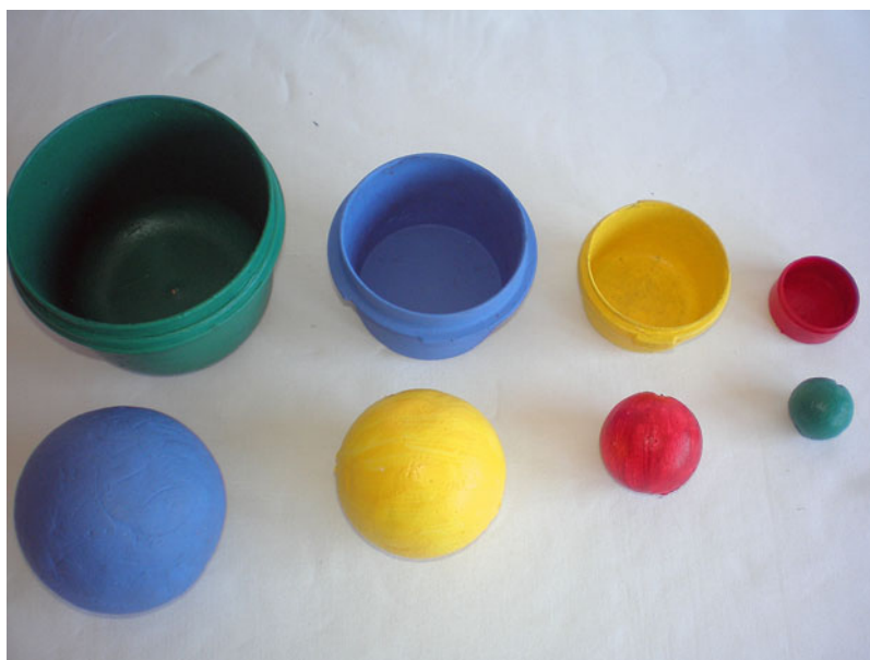
Figure 3. Interfering task: Stimulus material.

Through different semisystematization processes—the final process consisting of a list of distinctive features—these narrative recordings allowed us to identify the different actions that were developed by the children studied. These distinctive features included the following: grouping, pulling, putting a ball in a beaker, no activity, no action and not focusing on the materials, the repetition of an action without paying attention, putting a ball in a beaker and removing it quickly, fitting together, making towers, or putting two balls in the same box.