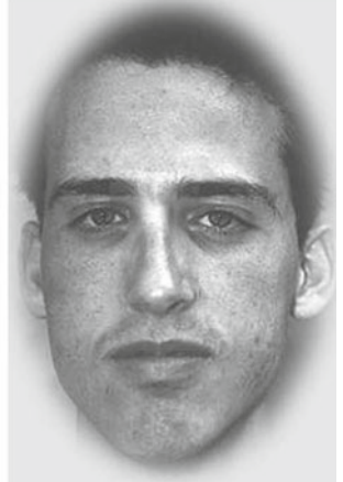
Figure 2. Example of a stimulus set for Task 6 (sequential matching of part—whole faces). Panel A shows the target face. Feature testing (here, with the nose) occurs either in isolation (panel B) or in the context of the target face (panel C; original nose on the left and different nose on the right). The faces are from Endl et al. (1998).

facial feature from the target (e.g., its nose) was presented along with the same feature from a different face. This facial feature was displayed in either of two conditions: in the context of the whole target face (e.g., the target's nose vs. another nose presented within the target face) or as isolated features (e.g., simply the target's nose vs. another nose). The task was to discern either which face was the target (in the whole condition) or which feature belonged to the target (in the part condition). The central facial features of eyes, nose, and mouth were tested separately and in equal proportions. To form the stimuli, each face was used once as a target and once as a distractor, but in each case was paired with a different face. The same stimulus pairs were used across the conditions. Face stimuli were