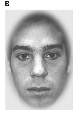
Figure 3. Example of a stimulus set for Task 7 (simultaneous matching of spatially manipulated faces). Panel A shows the original face. In panel B, the mouth—nose relation is altered by moving the mouth down by 11 pixels. The faces are from Endl et al. (1998).

manipulating difficulty, and were as follows: (1) moving the eyes up or down by 9, 11, or 13 pixels; (2) moving the eyes in or out by 10 or 12 pixels in total; and (3) moving the mouth up or down by 7, 9, or 11 pixels—thus changing either the eyes—nose or the mouth—nose relation (see Figure 3 for an example). For the eyes up/down manipulation, the area containing the eyes, eyebrows, and bridge of the nose was shifted vertically. The faces did not depart from the range of normal variation after the spatial changes; this was partly achieved by using only typical faces as the stimuli to be manipulated. The same stimuli were used across conditions. The face stimuli were taken from PICS (see Task 1). This test was intended as an accuracy task.