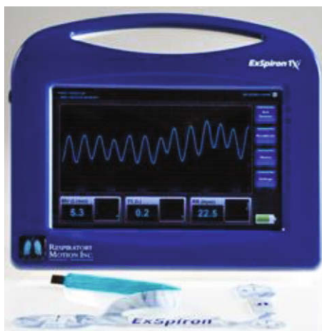
Figure 1 | ExSpiiron respiratory volume monitor (Respiratory Motion, Inc., Waltham, MA, USA) [19].

The research was performed in the PACU of Africa Inland Church Kijabe Hospital, located in the rural Kiambu County,