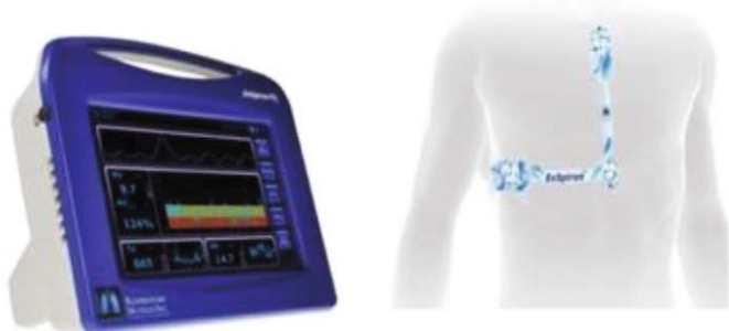
Figure 2 | Standard PadSet placement. Noninvasive respiratory volume monitor [19].