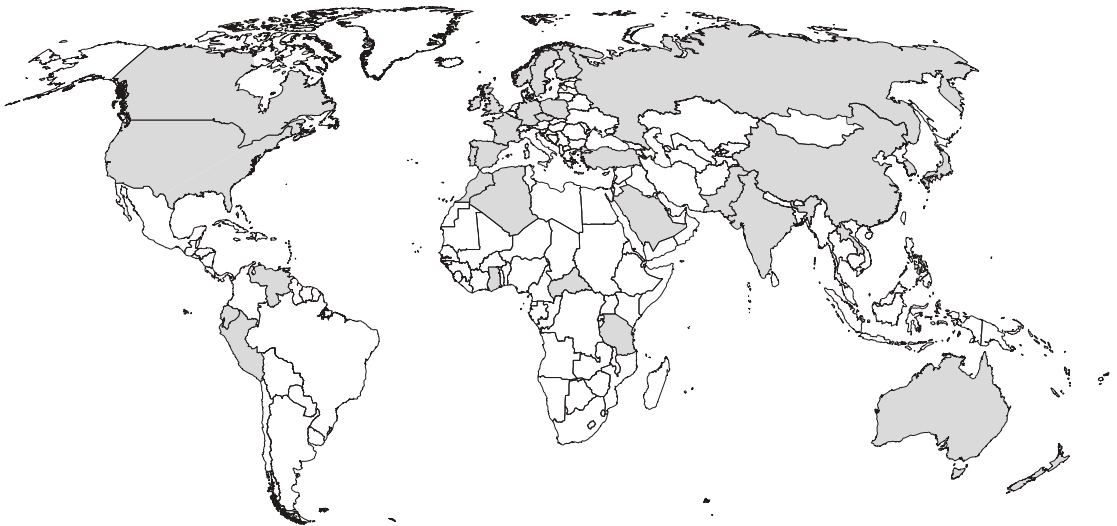
Fig. 1. Worldwide distribution of Escherichia coli that produce CTX-M-15 (grey shading).

In Africa, CTX-M-15-producing E. coli has been identified in Saharan (Algeria, Tunisia) and sub-Saharan countries including Cameroon, Tanzania and the Central African Republic. [40-43]