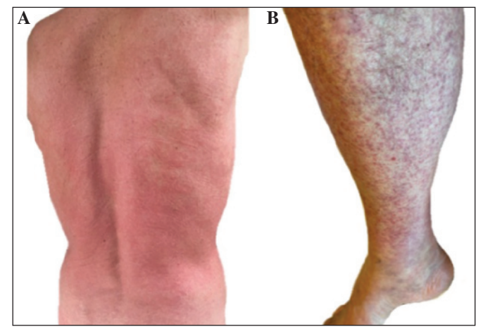
Figure 1. Clinical images of the case: A) confluent erythema on the trunk; B) livedoid lesions on the lower legs.

A 58-year-old healthy man developed fever and chills on March 23<sup>rd</sup> and received hydroxychloroquine and minocyclin at home. On April 4<sup>th</sup>, he developed a macular rash with confluent erythema on the trunk and limbs, without itching ( figure 1A ). Because of the worsening of fever (up to 40°C), he was hospitalised on April 5<sup>th</sup>, continuing hydrox-