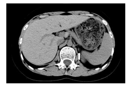
Fig. 2 Computerized tomography (CT) of abdomen of II-2 CT revealed small adrenal glands as indicated by the arrow

The patients' father (I-1) and mother (I-2) had both undergone normal puberty without any symptoms of adrenal insufficiency.