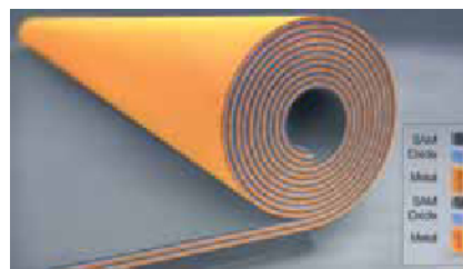
Self-rolled nanomembrane supercapacitor showing the hybrid layer sequence of self-assembled monolayer-oxide-metal.

p. 2506), the research team deposited strained multilayered nanomembranes by sequential depositions of metal and dielectric thin films on a sacrificial layer. Selective etching of the sacrificial layer initiated self-rolling of the nanomembranes into cylinders. The compactness of the cylinders was reproducibly tuned by careful control of the processing parameters. Hundreds of self-rolled cylinders can be prepared in parallel on a single chip which can be reused repeatedly. Furthermore, the research team demonstrated that organic monolayers may be introduced in the inorganic films of the nanomembranes to reduce leakage currents. In addition, these organic monolayers could be potentially leveraged for biological and chemical functionalization of these electronic elements with organic molecules. This self-rolling process can occur in aqueous media at physiological pH and is thus compatible for incorporation of biomolecules.