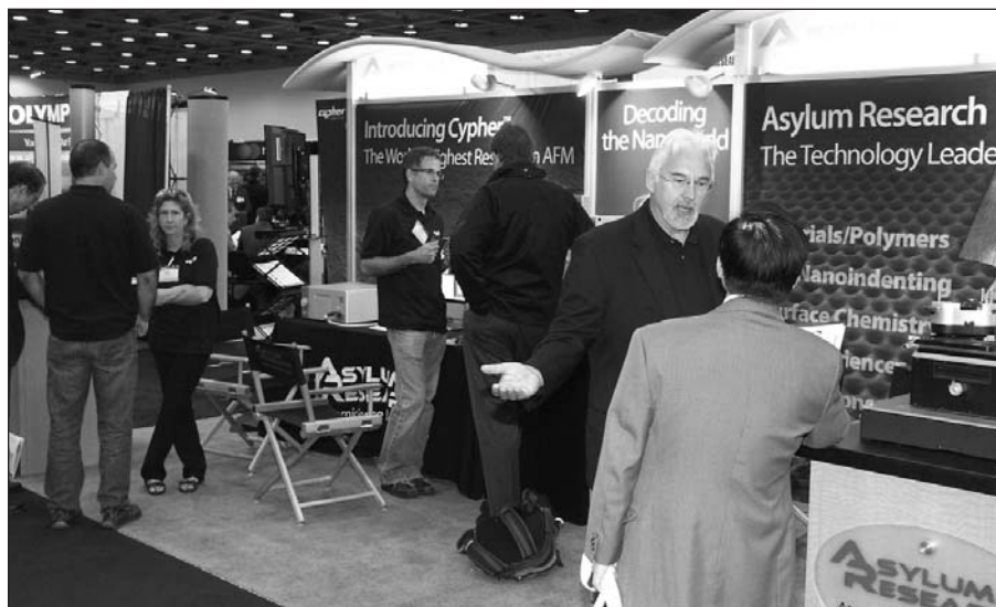
MRS Meeting attendees meet with equipment exhibitors to explore new products.