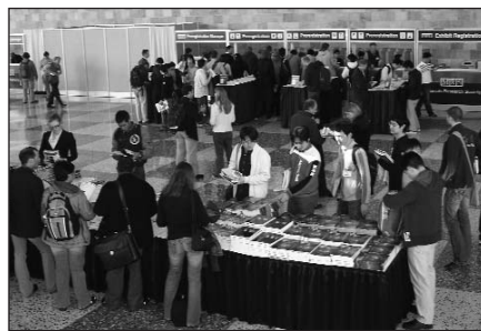
2009 Materials Research Society Spring Meeting.