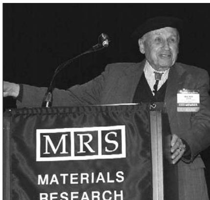
Nobel laureate Walter Kohn of the University of California, Santa Barbara gave the plenary address on the topic of materials challenges in solar energy.