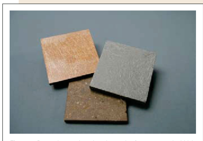
Figure 1. Domestic wasteboard made mostly of unsegregated rubbish.

building materials are being investigated and brought into the construction marketplace with renewed vigor. Hemp, straw, sisal, and jute are being used as fiber reinforcements or fillers for composite products (where limecrete, epoxy, phenolics, or formaldehyde-based binders are used) and blocks. The manufacturing of films and polymers from starch is also in development, as is the production of adhesive systems based on tannins. Whether these types of materials ever make it into the mainstream remains to be seen, but their use in more niche buildings will inevitably grow.