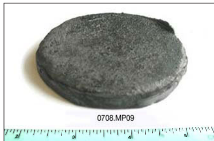
Figure 1. Typical carbon foam produced by the one-step process developed at Wright Materials Research Co. (WMR).

Researchers at WMR have developed an environmentally sound technique for the processing of carbon and graphitic foams