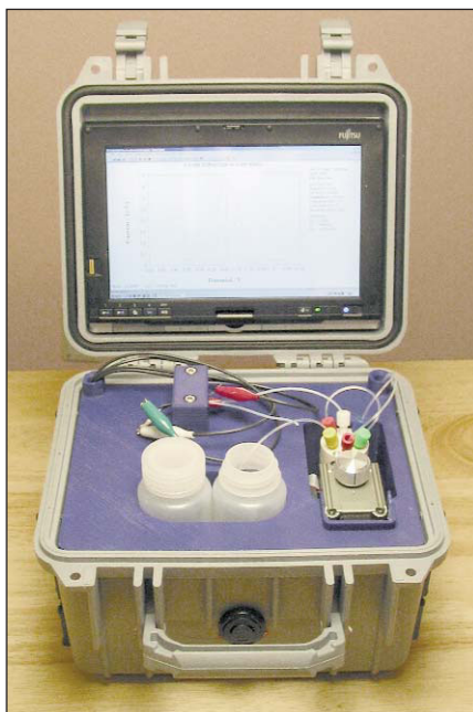
Figure 1. The biomonitoring detection system, developed by the Pacific Northwest National Laboratory, uses two classes of sensors to analyze water, saliva, or urine samples. The system is also being evaluated for use with blood samples. Although small and portable, the system provides detection levels at parts-per-billion.

Although mercury-based electrode materials also have been demonstrated to provide good analytical performance in the electrochemical system, mercury is a toxic material that may be subject to future regulation. In biological samples, use of the nanomaterials avoids using mercury as a preconcentrator. It elimi-