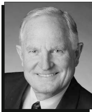
Craig R. Barrett

Barrett is the current chair of the National Academy of Engineering, and in this role, he promotes the Academy and its policies to the engineering community and the public. He also chairs the Computer