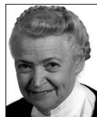
Mildred S. Dresselhaus

Mildred S. Dresselhaus of the Massachusetts Institute of Technology received the 11th Heinz Award for Technology, the Economy, and Employment in recognition of her contributions as a scientist, researcher, educator, and trailblazer for women in the sciences. An MIT professor and researcher for more than four decades, Dresselhaus is recognized by the Heinz Award as one of the United States' foremost experts in the multifaceted field of condensed matter and materials physics. Her investigations into the electronic properties of graphite, the structure and properties of novel forms of carbon, thermoelectricity, and the new physics at the nanometer scale have significantly advanced these fields, while at the same time, she has worked to break down stereotypes and expand opportunities for women in science. She has lectured around the world, written extensively about her research and served in prominent leadership roles, including as director of the Office of Science at the U.S. Department of Energy and as president of