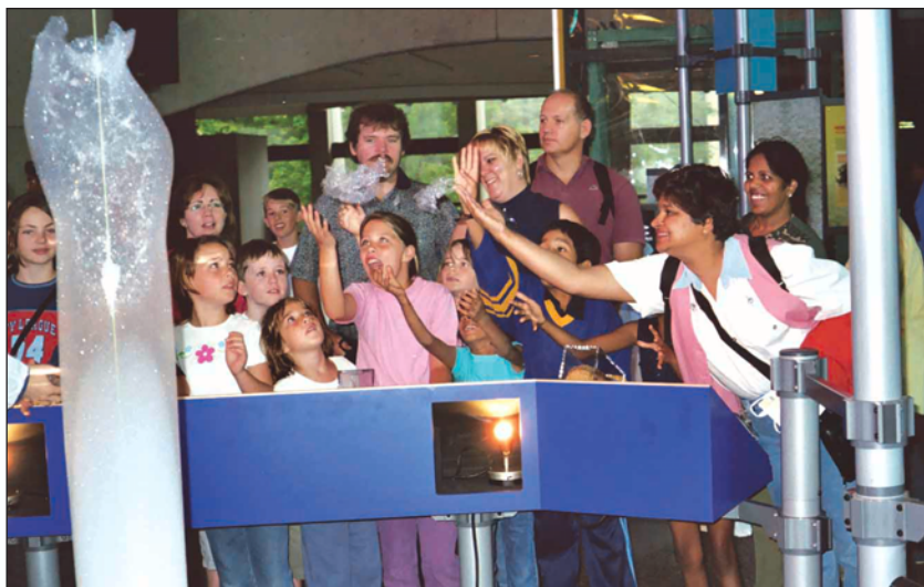
Visitors investigate materials in the Strange Matter interactive exhibit at its public preview in the Ontario Science Centre.

MRS, along with the National Science Foundation (NSF) and the Ontario Science Centre, developed the traveling exhibit, receiving input from MRS scientists, distinguished members of related scientific communities, and experts and evaluators from the museum and education fields. Strange Matter will begin its three-year tour to major science centers in February 2004. Funding is provided by NSF, Alcan, Dow, Ford Motor Company, and 3M Foundation. For more information, access the MRS Web site www.mrs.org/strangematter .