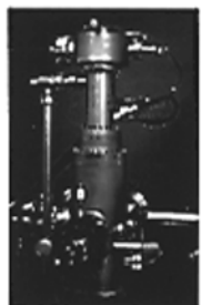
Photo Emission Electron Microscope