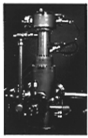
Photo Emission Electron Microscope