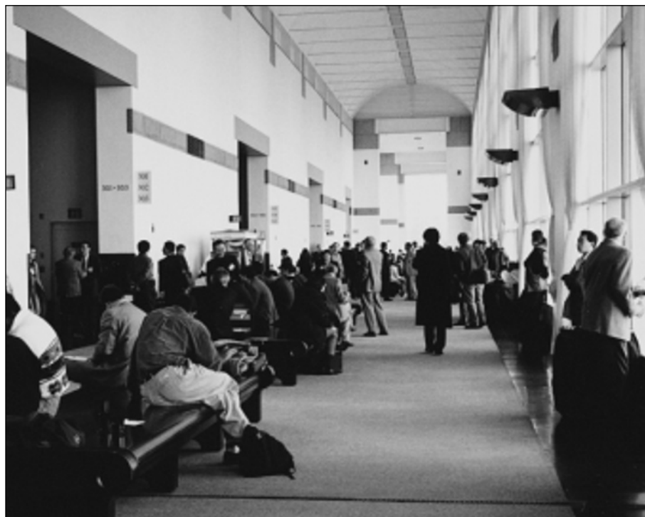
Due to the growing number of presentations and attendees at MRS Meetings, the 1999 MRS Fall Meeting was held for the first time in the Hynes Convention Center in Boston.

Symposium W covered GaN and related alloys, continuing the symposium series. Progress in lasers included reports of commercialization by Nichia Chemical of a laser operating at a 405-nm wavelength with a 4000-h device lifetime. Improvements in the epitaxy of GaN were discussed, using both selective-area growth techniques (lateral epitaxial overgrowth) and introduction of low-temperature intralayers in the films. Advances in both MBE and MOVPE were reported, including several studies of quantum-dot