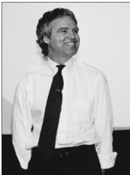
Nobel Laureate Horst Stormer (Columbia University and Lucent Bell Labs) presented the plenary talk on his work with the discovery of a new form of quantum fluid with fractionally charged excitations for which he received the 1998 Physics Nobel Prize. For more on Stormer's work, visit www.nobel.se/announcement-98/physics98.html and www.phys.columbia.edu/faculty/stormer.htm .

For many years, electroactive ceramics, magnetostrictive materials, and shape memory alloys have been the primary source of actuation materials for manipulation and mobility systems. Electroactive polymers (EAP) received relatively little attention due to their limited capability. In recent years, effective EAP materials have emerged. Their main attractive characteristic is their operational similarity to biological muscles, where under electrical excitation a large displacement is induced. This forum became an important addition to the other forums that were established this year, including the EAP Conference of the SPIE Symposium on