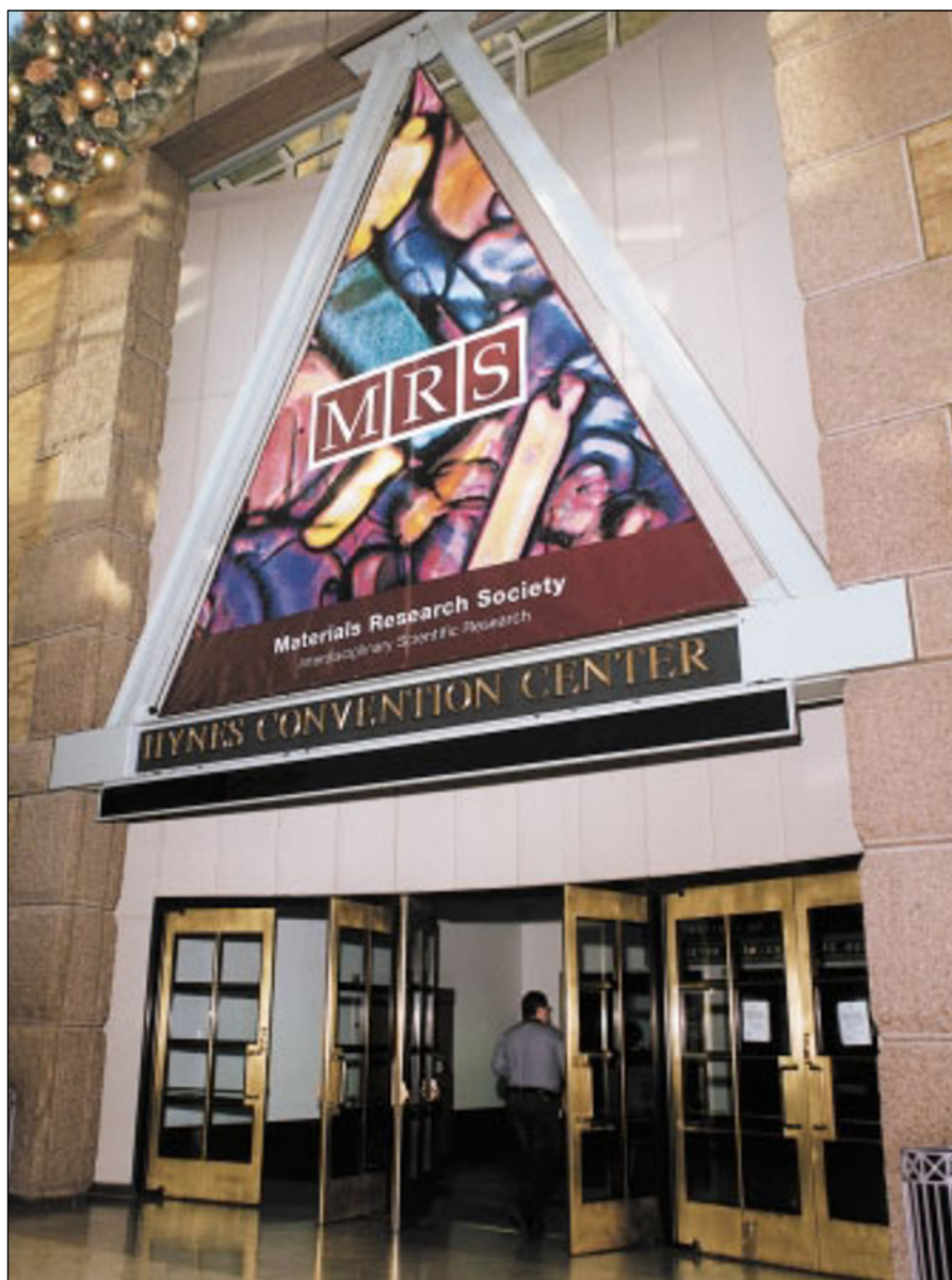
The Materials Research Society moved its Fall Meeting into the Hynes Convention Center in Boston in 1999.