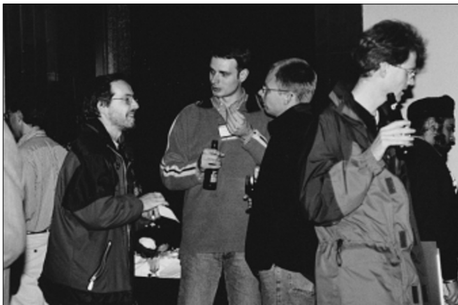
On Sunday evening, students took the opportunity to meet one another and other MRS members at the Student Mixer.

F. Jansen (Sulzer Innotec Ltd.) described the thermal-shock resistance, thermal-insulation efficiency, and corrosion resistance of thermally sprayed dicalcium silicate ( \text{Ca}_2\text{SiO}_4 ) coatings as comparable to yttria-stabilized zirconia coatings, and promising as thermal-barrier coatings up to 900^\circ\text{C} . The potential of high-velocity oxygen-flame-sprayed barium titanate ( \text{BaTiO}_3 ), alumina ( \text{Al}_2\text{O}_3 ), and magnesium aluminate ( \text{MgAl}_2\text{O}_4 ) as dielectric layers with functional properties for electronic components was reported by A. Dent (SUNY—Stony Brook). A number of materials-characterization techniques (SEM, TEM, XRD) were used to investigate phase transformations occurring within these materials as a consequence of thermal spraying. The advantages of thermal spray are that it is a quick and easy way to coat large areas, and it is a high-throughput technology.