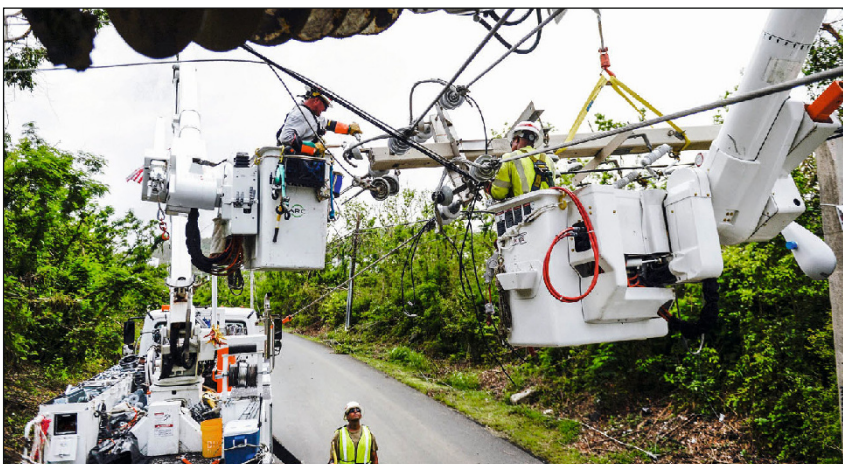
Transmission and distribution specialists assigned to Company D, 249th Engineer Battalion (Prime Power) of the US Army Corps of Engineers, repair power lines in Rio Grande, Puerto Rico, after Hurricane Maria.