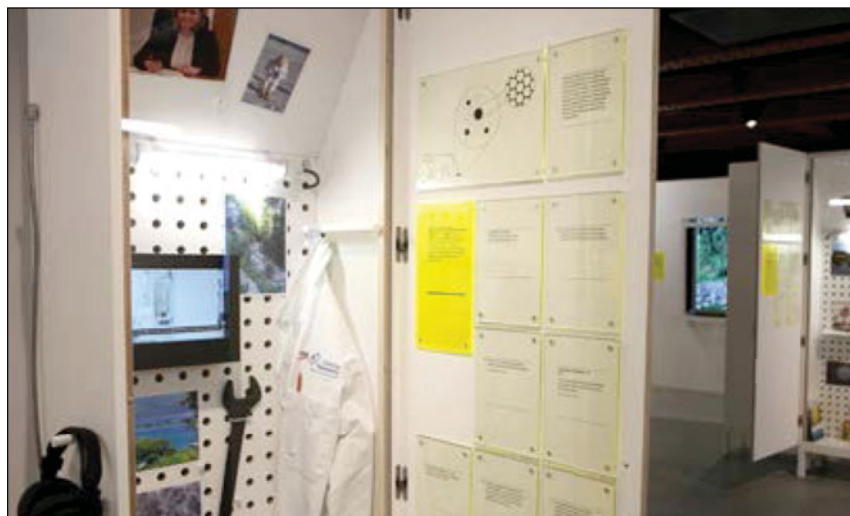
locker.