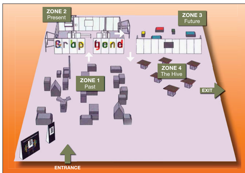
Schematic of the exhibition, Wonder Materials: Graphene and Beyond.