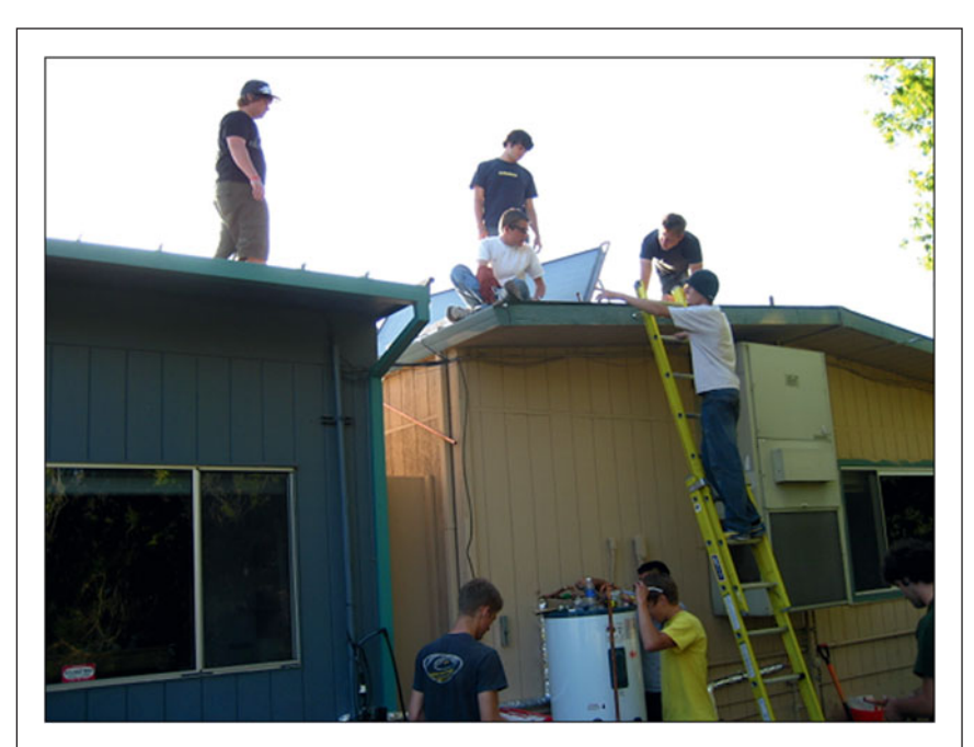
Figure 3. Freshman service learning project with a California K–6 charter school to install a solar water heater. Cal Poly students conducted a user needs assessment and identified the engineering design constraints and requirements to provide hot water to school children to wash their hands and for the science teacher to conduct experiments. They then installed the system and still maintain it.

strikes, and embargos). Current news articles are used to emphasize the topics' relevance, and directed reflection assignments and in-class discussions allow greater opportunity for thought on the impact of engineering on people and the planet. For example, an assignment that has a significant impact on students is a set of articles and photo gallery<sup>12</sup> on the electronic wastes that end up in developing countries. Students make the connection between their latest cell phone and young children exposed to toxic materials in other parts of the world. Likewise, the connection between the demand for rare-earth metals for renewable energy technologies and the devastation of farmland in China<sup>13</sup> requires broader views and systems thinking.