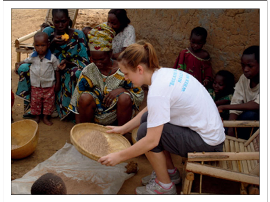
Figure 2. Student working with women in a village in Mali to help determine energy and cooking needs.

It is also important to extend the discussion of sustainable development beyond engineering. To that end, Engineering and Economics faculty have co-created a course called "Globalization and Sustainability" that teaches a systems-level view of sustainable development and is open to all undergraduates. Taught in the "Technology and Social Change" program in the College of Liberal Arts and Sciences, this course includes students from all six undergraduate colleges and from all stages of their undergraduate experience, with enrollment of approximately 100 students. Materials make up an appreciable portion of this class, with a focus on the ubiquity of materials in technology, as well as the scarcity of some resources and how that scarcity can have an impact on future technological solutions for sustainable energy