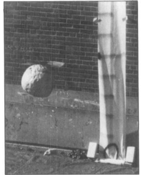
During: Sample after primary impact. Some fissures are visible at the bottom of the sample.

The brittle failure can be attributed to localized regions of high stress intensified by