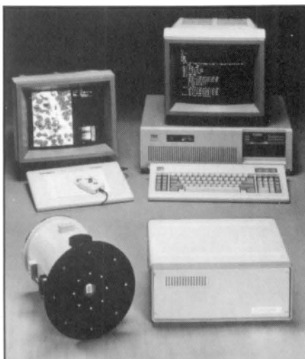
Ultralow Light-Level Imaging System

Complete with camera, computer, and image processing software, this imaging system uses CCD technology originally developed for ground and space astronomy where the highest possible sensitivity and photometric accuracies are required. The CCD 2200 is sensitive to light levels as low as one photon per pixel per minute, and with its high dynamic range, it can accept light levels as high as 109 photons per pixel per second. The dynamic range in a single exposure exceeds 100,000:1, and advanced cooling technology minimizes dark current in the detector. The system has proven applications in microscopy, spectroscopy, x-ray and electron beam imaging, immunoassay, and astronomy, but it can enhance any technique that uses light imaging. Microscience, 41 Accord Park Drive, Norwell, MA 02061; (617) 871-0308.