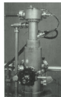
Photo Emission Electron Microscope