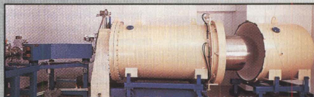
Single Ended Pelletron, Model 3UH