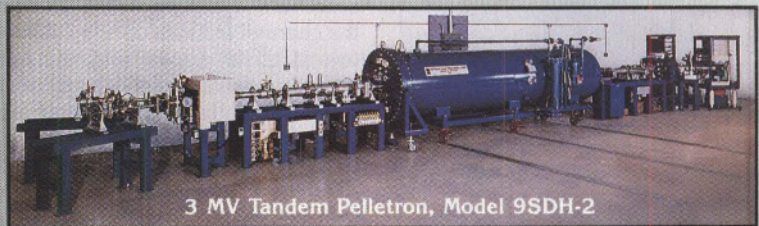
3 MV Tandem Pelletron, Model 9SDH-2

Tel. 608/831-7600 • Telex 26-5430 • Fax 608/256-4103