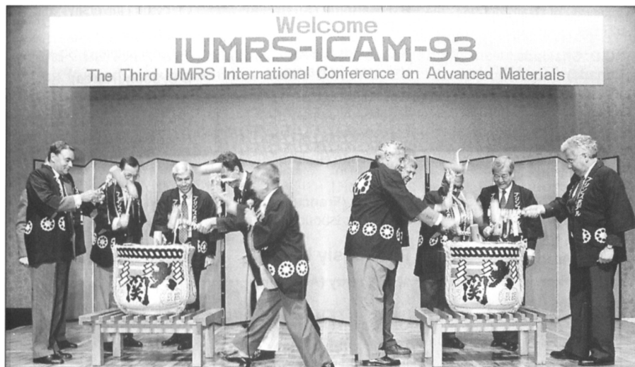
Ceremonial opening of sake barrels at ICAM'93 banquet.

Held September 3 and 4, Symposium E was supported by the Amada Foundation for Metal Working Technology, Japan, and the Research Group of Superplasticity in Japan. In the past, the concept of superplasticity dealt mainly with some special alloys but has now expanded dramatically to include many commercial alloys, ceramics, intermetallics, and composites. The forming technique utilizing superplasticity is not only expected to become a novel process for future industries, but the phenomenon also attracts attention because it is a common property of materials with a nanoscopic or mesoscopic structure. The objective of the symposium was to gather researchers from various specific materials fields to focus on rapid advances in superplastic phenomena of advanced materials. The organizers endeavored to form a basis for the future development of this field, which is still in its infancy as an industrial technology. The number of presentations in the symposium was not large (32 papers), but 40% of them came from abroad, including the invited papers by B. Baudalet and I.W. Chen. The gathering of most key people in this field initiated active discussions. The issue of a future direction for this field and the need for guiding principles became a consensus.