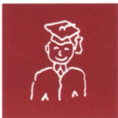
Top of its Class