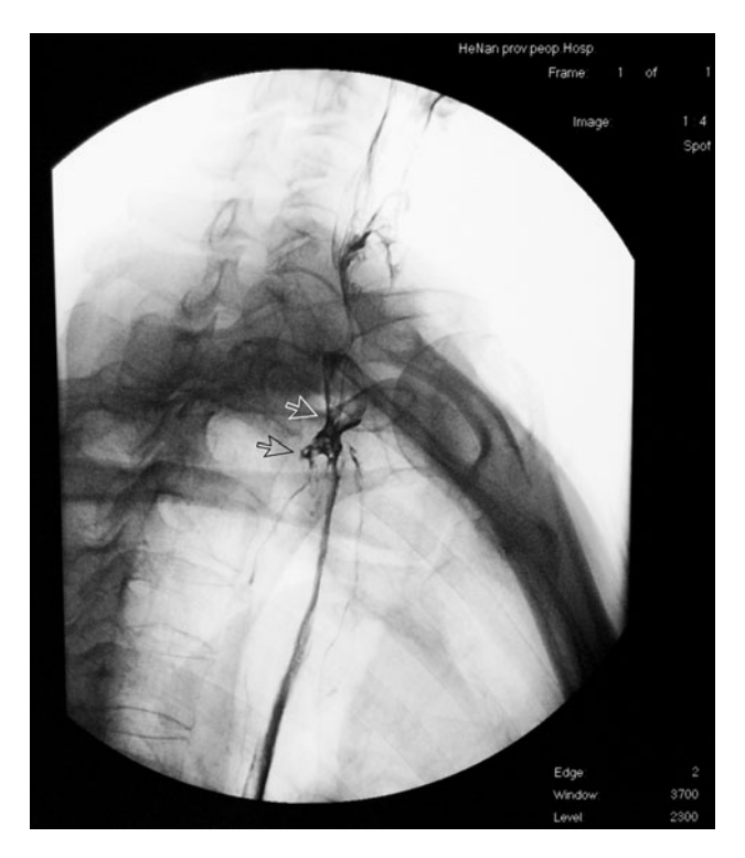
FIG. 3 Open anastomosis during a barium meal test (black arrow) and compression of the esophagus by the upper portion of the stomach (white arrow)

than that of acid regurgitation (9.8 and 8.9 %, respectively). Although it was thought that the pyloroplasty could reduce the occurrence of reflux, we only dissociated the connective tissue around the pylorus instead of conducting pyloroplasty, and no severe duodenogastric reflux occurred.<sup>26</sup>. We thought that the gastric acid secretion of a nerve-free stomach could gradually recover over time, which was demonstrated by comparing the 3- and 6-month data, while no obvious change in acid regurgitation rate was observed, similar to other published results that indicated that embedding in the proximate stomach presented an antireflux effect.<sup>2</sup>