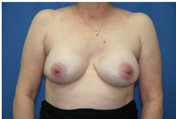
Post-op Bilateral NAS Mastectomies